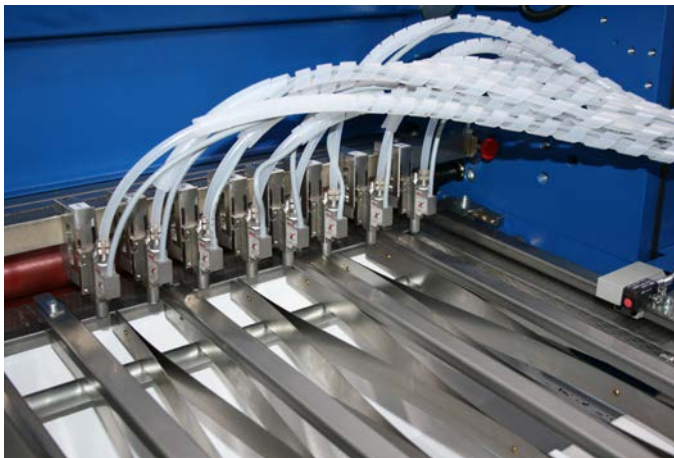
New waterscoring system for even more precise water application