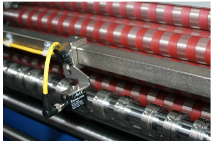
Sheet control and special outsert scoring tools